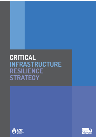
Critical Infrastructure Resilience Strategy, July 2015 (Image: EMV)

The strategy and associated legislation require that risk management processes are implemented, tested, and quality assured to build the resilience of Victoria's 'vital' critical infrastructure and ensure continuity of supply of essential services to the community.