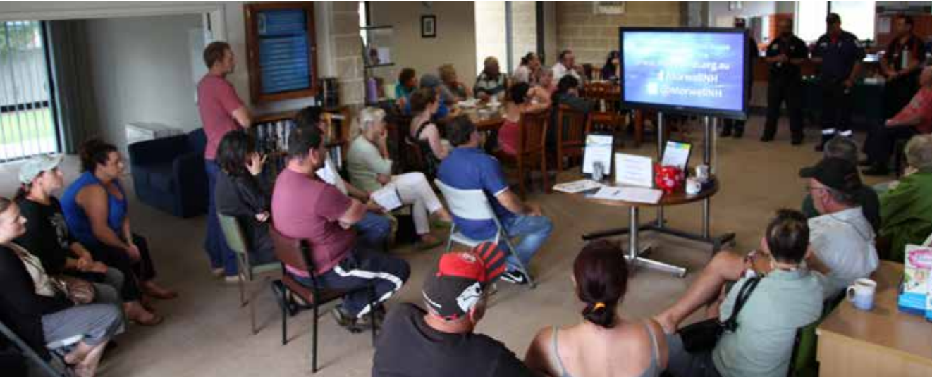
Information session held at Morwell Neighbourhood House, 18 February 2014

In March 2015, DHHS finalised the Community Profiling Protocol and Template , which provides guidance on how to prepare a community profile so that information may be used to directly support and inform a WoVG communications strategy, which is prepared and enacted in response to a major emergency. The protocol provides direction as to how to source and compile a community profile or profiles for a local government area that is affected by an emergency event.