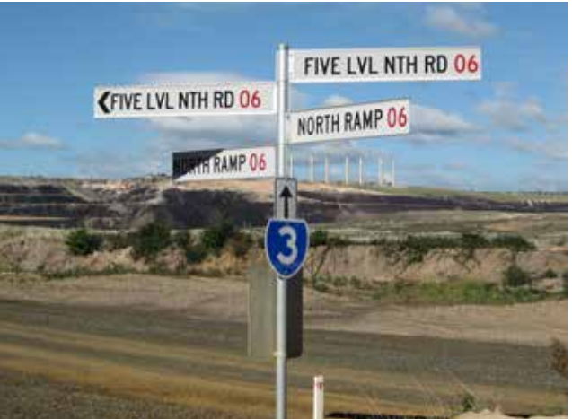
New signage erected in the Hazelwood mine.

On 11 September 2015, two employees were nominated to represent GDF SUEZ on the Latrobe City Council Municipal Fire Management Planning Committee. GDF SUEZ has been actively engaged in the committee attending all meetings since this date. Membership, which is detailed within the committee’s Terms of Reference, was formally revised at the 3 March 2015 meeting to include GDF SUEZ and a number of other local essential services provider representatives.