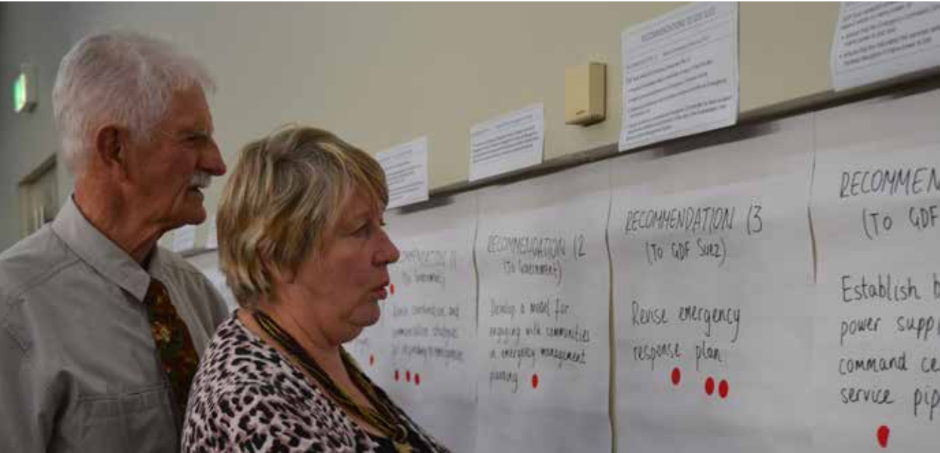
Residents participating in an Inquiry workshop to determine priorities

The Board adopted an open and accessible approach to the Inquiry with a strong commitment to local community engagement, adapted from the 2009 Victorian Bushfires Royal Commission approach. Ten public community consultation meetings were conducted throughout the Latrobe Valley over a six weeks period during April and May 2014 attracting 264 participants (p46, HMFIR).