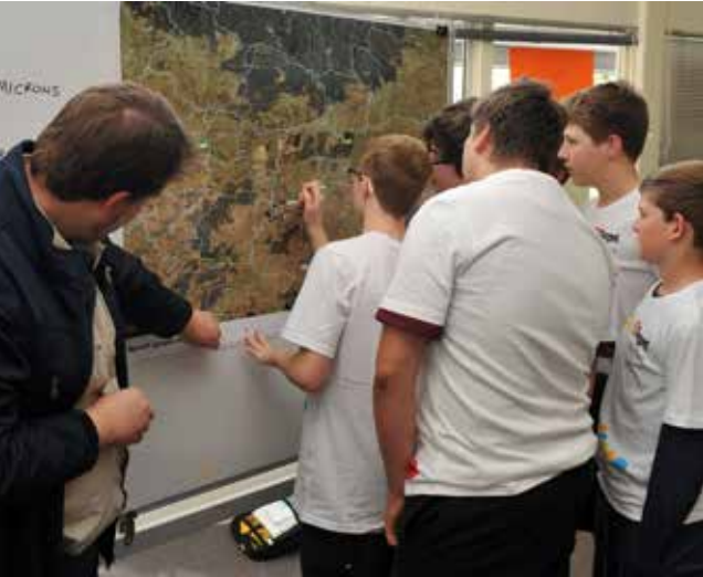
Students seeing on a map how close the mine fire was to their homes and how much smoke covered Morwell (Kurnai Kids Teaching Kids –)

The Chief Health Officer also recognised the importance of providing continual feedback to the community about the study’s progress. Accordingly, this will be a requirement of the contracted researchers to not only provide feedback to DHHS regularly but to also ensure this information is provided to the community and where relevant, to local health services.