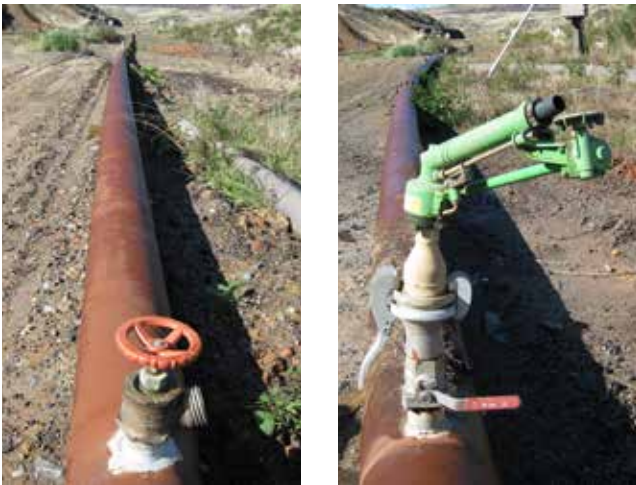
Firefighting pipeline , hydrants and sprinklers on the northern batters of the Hazelwood mine.

During the mine fire on 13 February 2014, the CFA Incident Controller in consultation with GDF SUEZ staff decided that extra pipework was required to effectively suppress the fire. Work commenced on 14 February 2014, ultimately leading to the installation of almost ten kilometres of additional 300 millimetre diameter steel water pipes. The Incident Controller believed that the additional fixed fire fighting infrastructure would make an important ongoing contribution to fire safety in the mine beyond the fire.