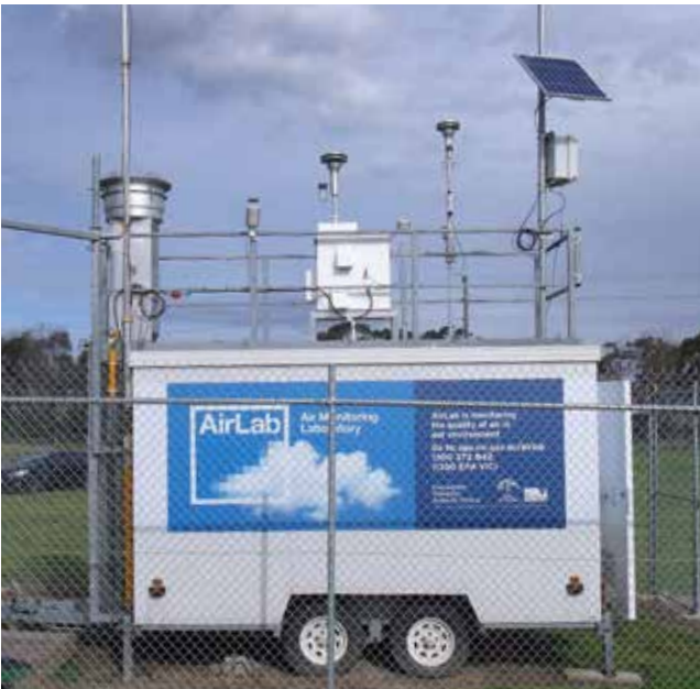
The mobile air monitoring station south of Morwell

Finding: The IM considers action 5.1 has been implemented satisfactorily.