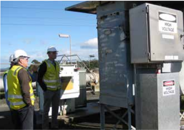
The IM inspects the pumping station's connections to Hazelwood mine power station's internal power supply via 2 high voltage underground cables.

R14.2 GDF SUEZ establish enhanced back-up power supply arrangements which enables the reticulated fire services water system to operate with minimal disruption if mains power is lost.