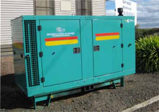
Generator to provide back up power to the ECC (Photo: IM).

R14.1 GDF SUEZ establish enhanced back-up power supply arrangements which enables the Emergency Command Centre to continue to operate if mains power is lost