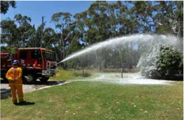
CFA Compressed Air Foam System tanker

The district has acquired two Compressed Air Foam System appliances which are considered best practice for fighting brown coal fires, and training in their use has commenced.