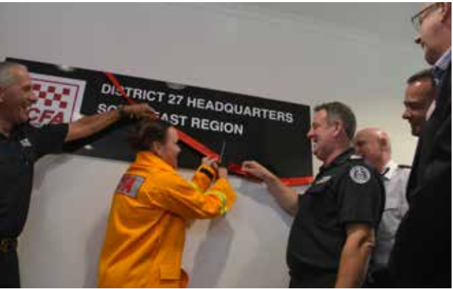
Opening of CFA District 27 interim headquarters in Morwell, 1 April 2015

IGEM expects to see significant progress during the next reporting period and will revisit this affirmation in the next Annual Report.