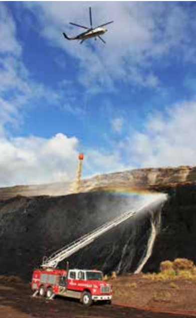
Hazelwood mine fire, February 2014

This report provides an update on the status of the 17 affirmations of actions made by the Victorian Government which the IGEM is responsible for monitoring.