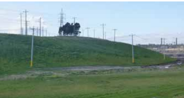
Vegetation on the northern batters (i) being cleared (ii) levelled and (iii) planted to pasture.

GDF SUEZ actively removed vegetation removal throughout 2014 prior to the commencement of the 2014-15 fire season. Vegetation (trees shrubs and grasses) removal commenced in August 2014 in the worked out areas of the northern batters and eastern batters closest to Morwell. Works generally proceeded in an anti-clockwise direction encompassing the north-west batters towards the currently operational West Field. In addition to removing vegetation from the batters, vegetation was also removed from the floor of the mine and on adjoining land above the mine.