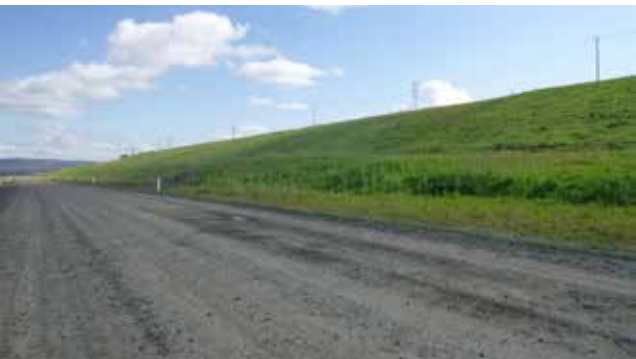
Rehabilitation works area C (i) laying back the batters and (ii) covered with topsoil and planted to pasture

Substantial progress was made during 2014 in mine rehabilitation as committed to by GDF SUEZ and referred to in the Inquiry Report as Exhibit 88, Annexure 5.