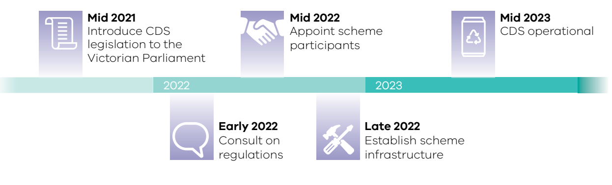
Figure 5: Key milestones

"I think it's a BRILLIANT idea to encourage people to do the right thing with their recyclables and for kids to make some pocket money to boot!"