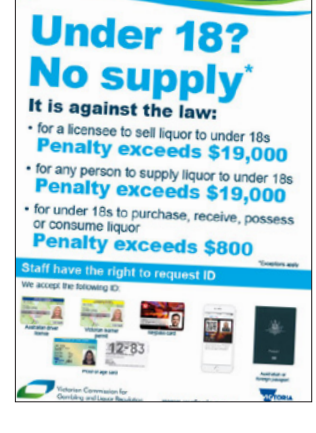
X Incorrect Must be aligned and include all content, including the keycode