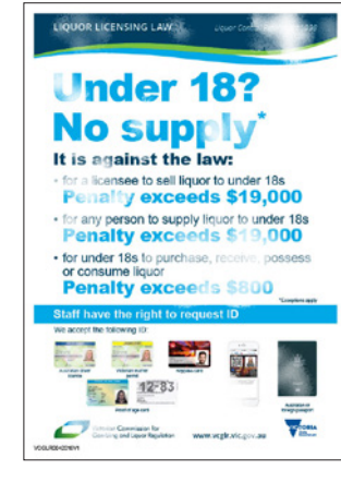
X Incorrect Must be cleanly printed without blurring or patches