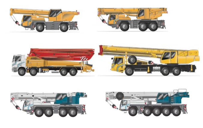
Figure 1 – Configurations operating under Gazette Notice

The crane's dimensions (length, width and height) are not considerations in determining whether the vehicle is over mass.