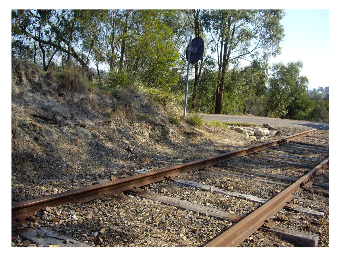
Figure 2 - Rail approach view of level crossing