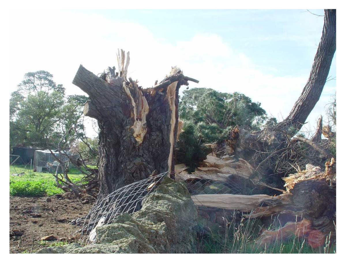
Figure 7 – Break in trunk of tree (note also its proximity to rock wall)