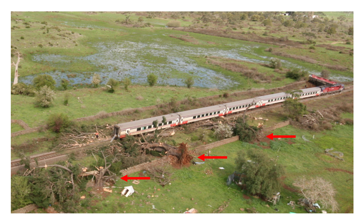
Figure 1 – Overview of derailment showing three fallen trees

This report makes a recommendation to VicTrack to develop guidelines for the Victorian rail industry regarding the management of vegetation in the rail reserve and on adjacent land.