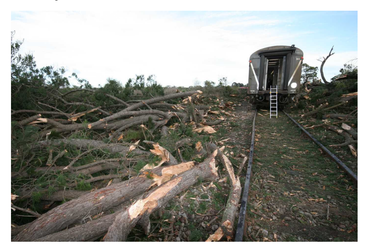
Figure 5 – Fallen tree coverage across track

The track structure between Geelong and Warrnambool is single-line broad-gauge (1600 mm), Class 2 track<sup>5</sup>. The line is owned by the Victorian Government business enterprise VicTrack and is leased to V/Line Passenger Corporation which is responsible for track maintenance. Between Winchelsea and Warrnambool (which includes the incident location) the line is worked under the Train Order<sup>6</sup> system of safeworking control.