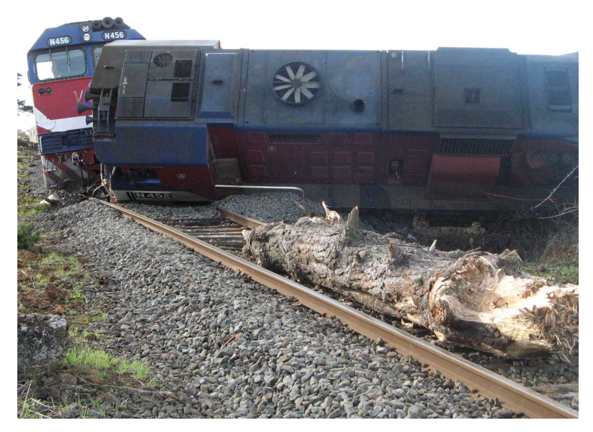
Figure 9 – Photo showing displaced log ahead of derailed train