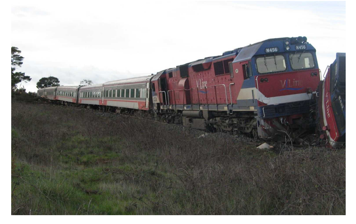
Figure 3 – The second locomotive (N456) and passenger cars remained upright