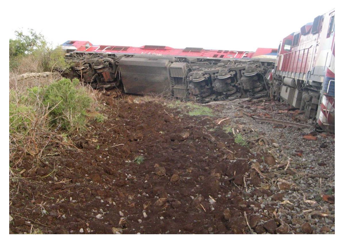
Figure 4 – The path of the derailed lead locomotive (N452)

The derailed passenger cars sustained minor wheel and bogie damage as well as some minimal damage to underslung equipment.