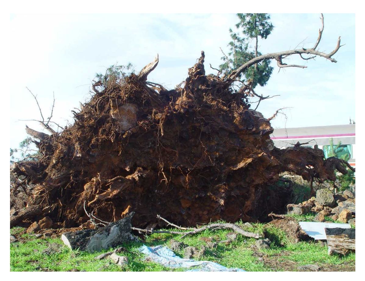
Figure 6 – Uprooted tree