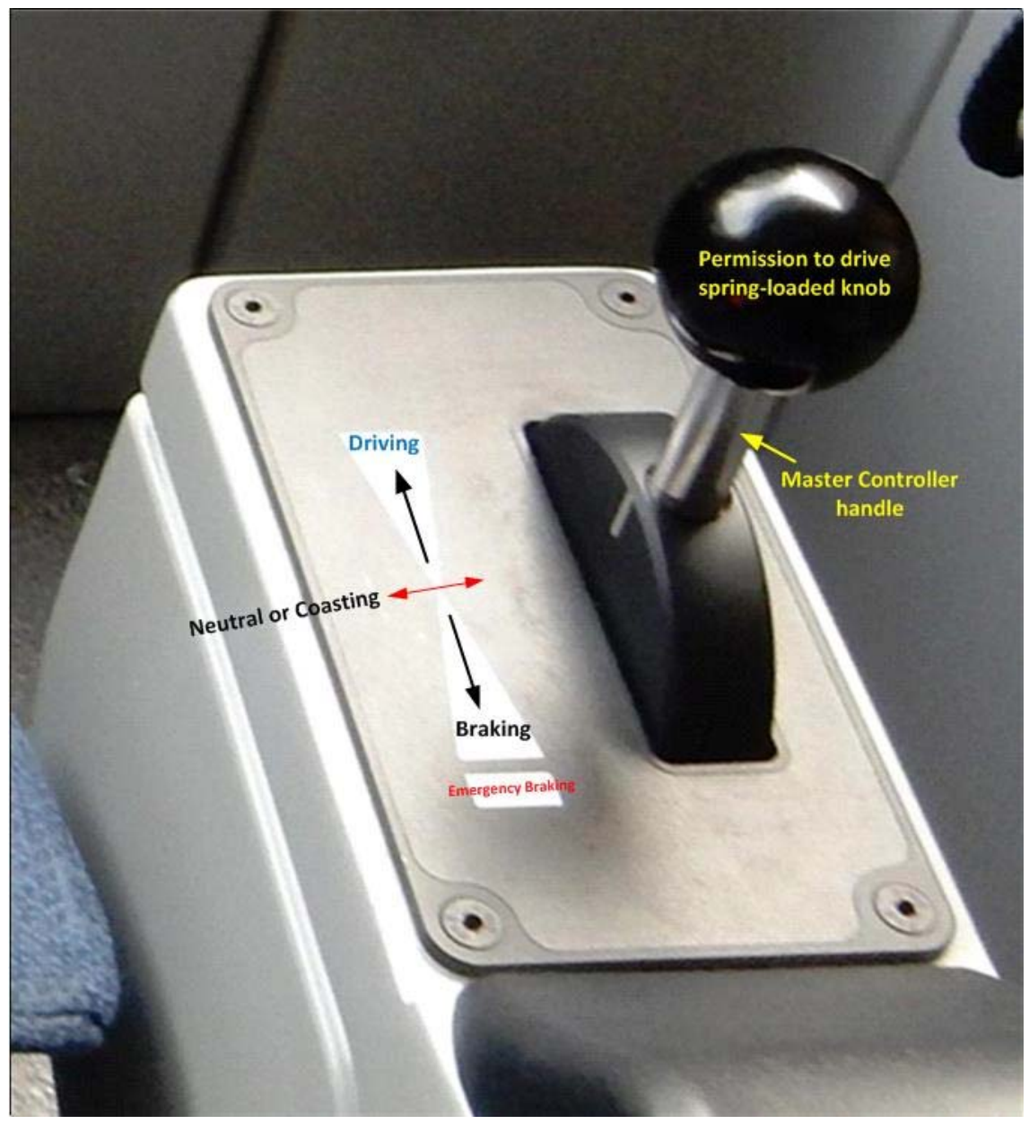
Figure 3: Master Controller

The controller must be depressed to activate the driving/braking function. The handle can then be moved forward to drive the tram and backward to brake. Post-incident testing of the incident tram indicated that a downward force of about 15N was needed to activate the driving/braking function.