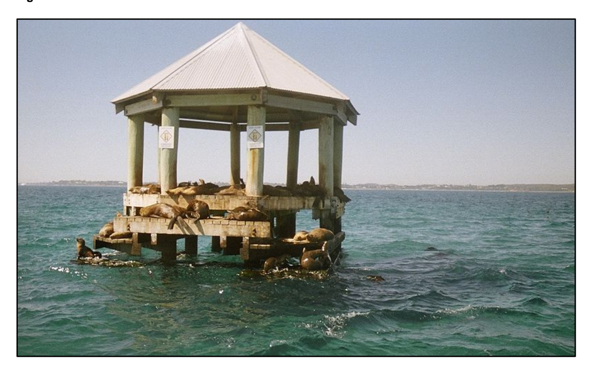
Figure 2: Chinaman's Hat

The structure and the surrounding waters are managed by Parks Victoria<sup>2</sup>. There are no fixed mooring points or platforms near the site, and visiting vessels can either drift or drop anchor. There are no anchoring restrictions in the vicinity of the structure.