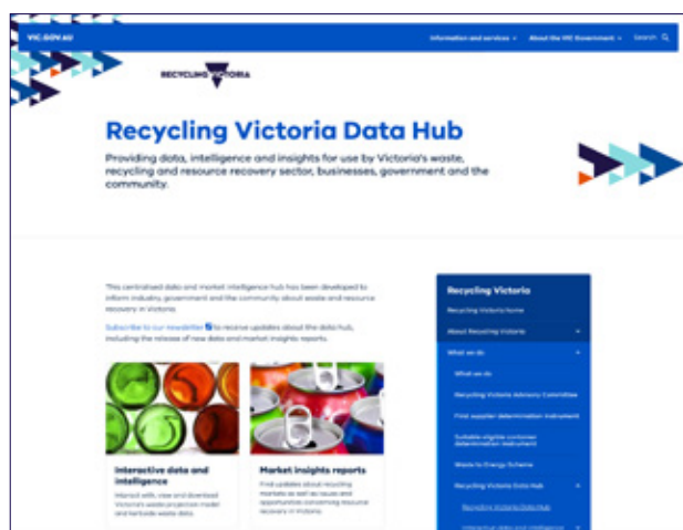
Figure 3 Community Engagement Strategy approach.

Our decisions and actions will be informed by market data and intelligence.