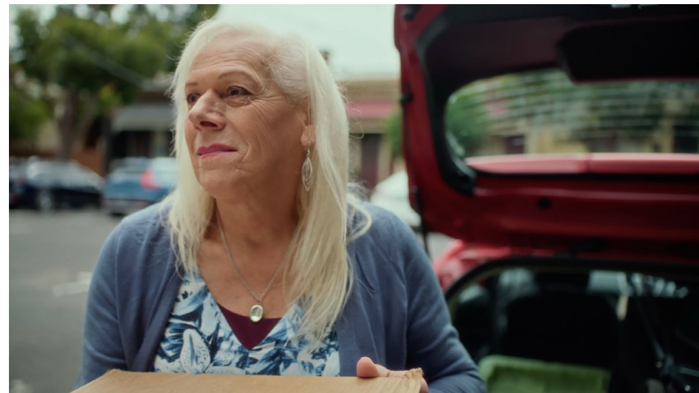
Moving in scene