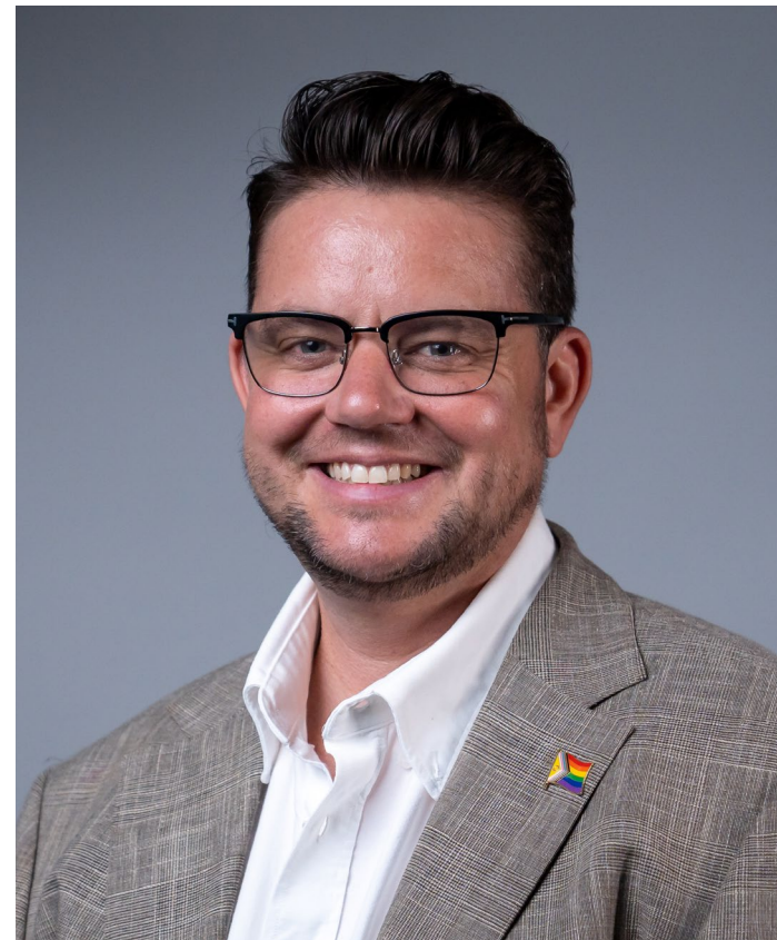
Joe Ball Commissioner for LGBTIQ+ Communities

"In our everyday lives, it's easy to show others kindness and respect, including towards trans and gender diverse people. Small actions make a big difference. When we include everyone, we build safer, fairer communities where people feel they belong. 'The Unsaid Says A Lot' is a nation-leading campaign reminding us that it's not hard to play our part. Equality is not negotiable in Victoria, and together we can continue to make our state a place where everyone feels welcome."