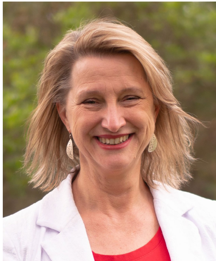
Vicki Ward Minister for Equality

"In our everyday lives, it's easy to show others kindness and respect, including towards trans and gender diverse people. Small actions make a big difference. When we include everyone, we build safer, fairer communities where people feel they belong. 'The Unsaid Says A Lot' is a nation-leading campaign reminding us that it's not hard to play our part. Equality is not negotiable in Victoria, and together we can continue to make our state a place where everyone feels welcome."