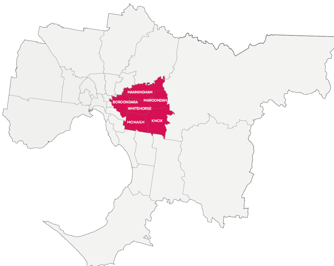
Figure 1 Eligible LGAs

Only eligible applications will be merit assessed and considered for invitation to Stage 2 .