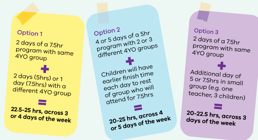
Figure 3 — Brilliant Bears program model options

They all agree that small groups (Option 3) may not be financially viable for the service, and reduce the capacity of the service. It is also noted that this style of program delivery may not have opportunities for children to interact with their peers and develop social skills and make friends. (Note information in sidebar for additional considerations around small group sizes).