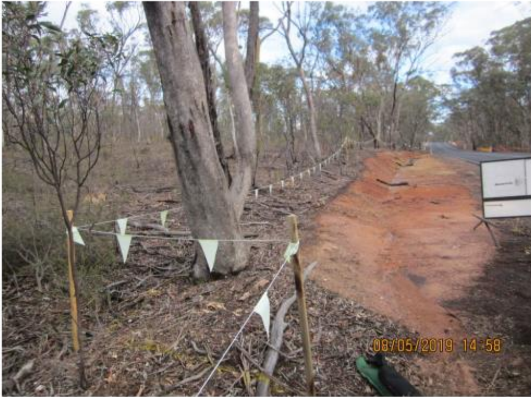
Plate 9. Pyrenees Hwy (Sec 2) Ch 11.615 – 11.880 km LHS, Limits of Works, 8 th May 2019.