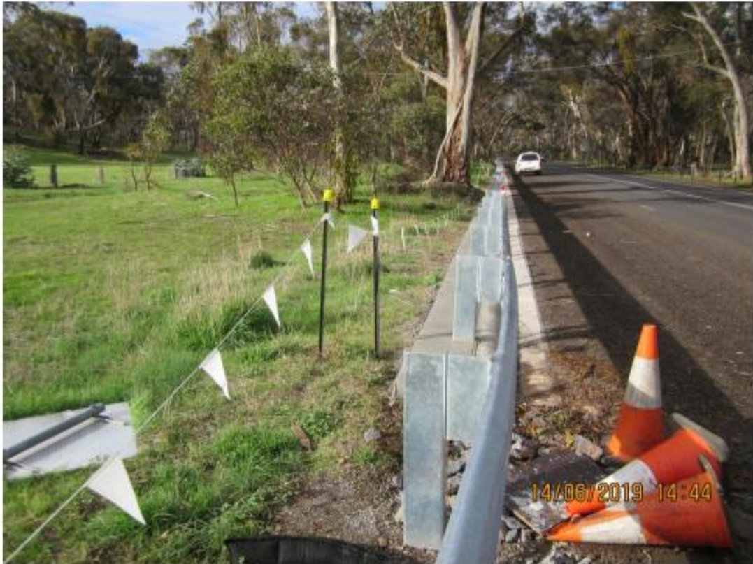
Plate 16. Pyrenees Hwy (Sec 2) Ch 12.800 – 12.575 km RHS, Limits of Works, 14 th June 2019.