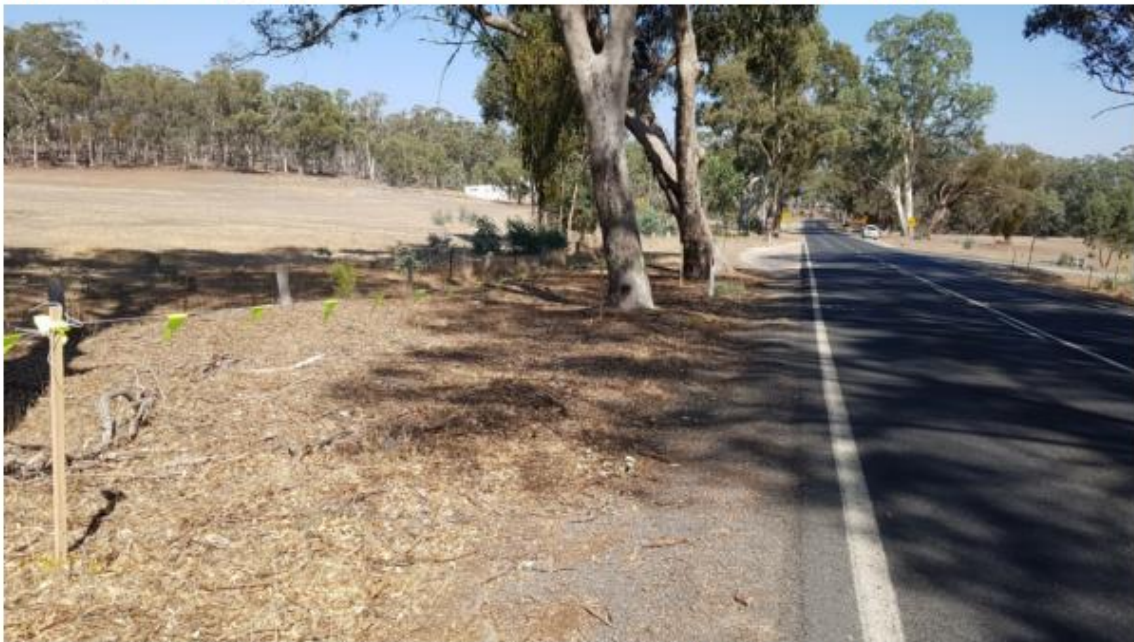
Plate 6. Pyrenees Hwy (Sec 2) Ch 14.720 – 14.880km HHS, Limits of Works, 7 th March 2019.