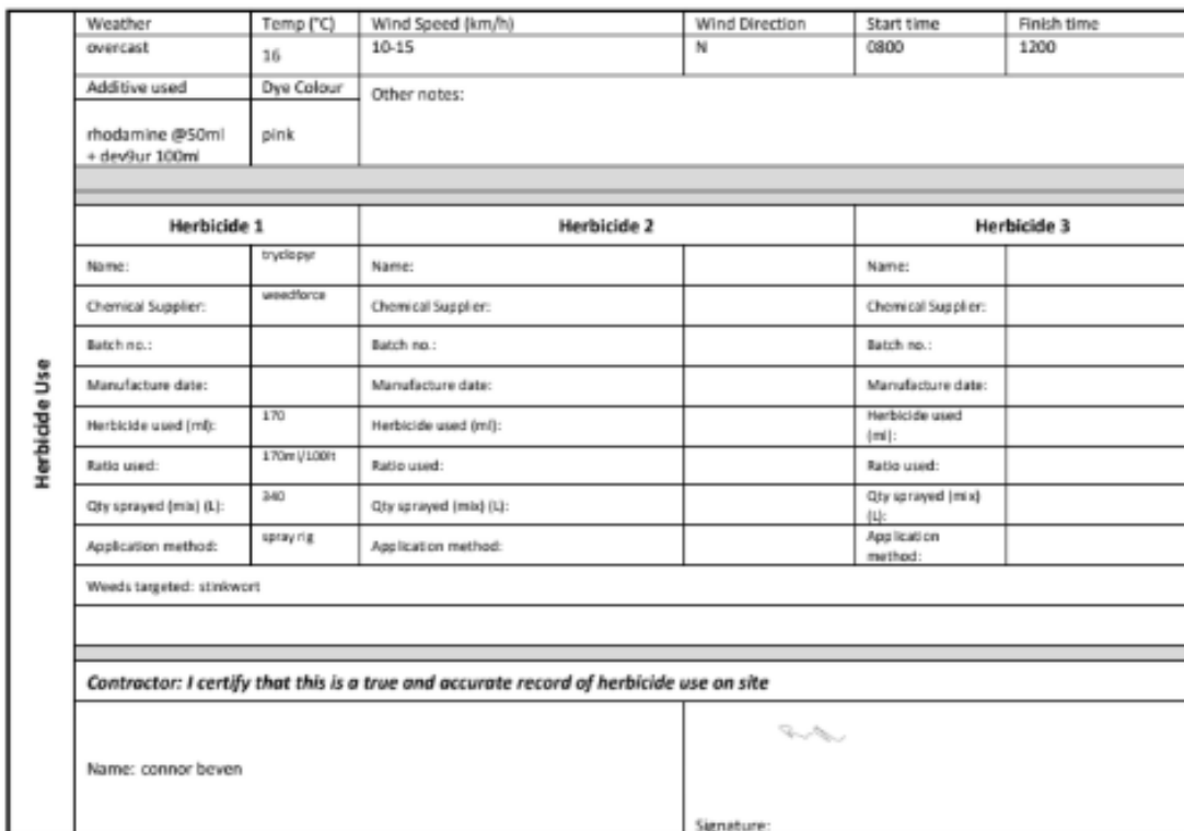
Figure 2: Evidence of control of Stinkwort in Autumn 2025.