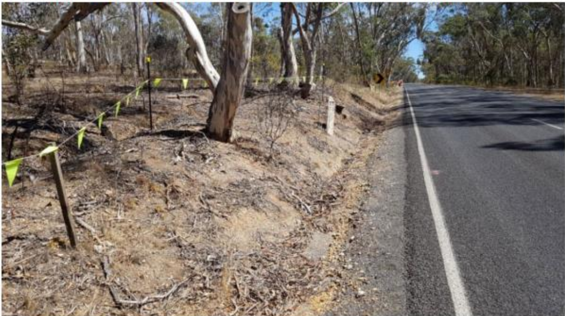
Plate 2. Pyrenees Hwy (Sec 2) Ch 12.980 – 13.325km LHS, Limits of Works, 7 th March 2019.