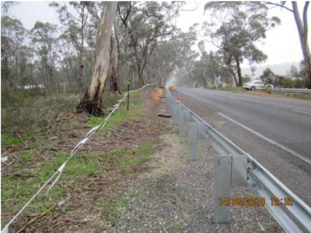
Plate 12. Pyrenees Hwy (Sec 2) Ch 13.705 – 14.065 km LHS, Limits of Works, 14 th June 2019.