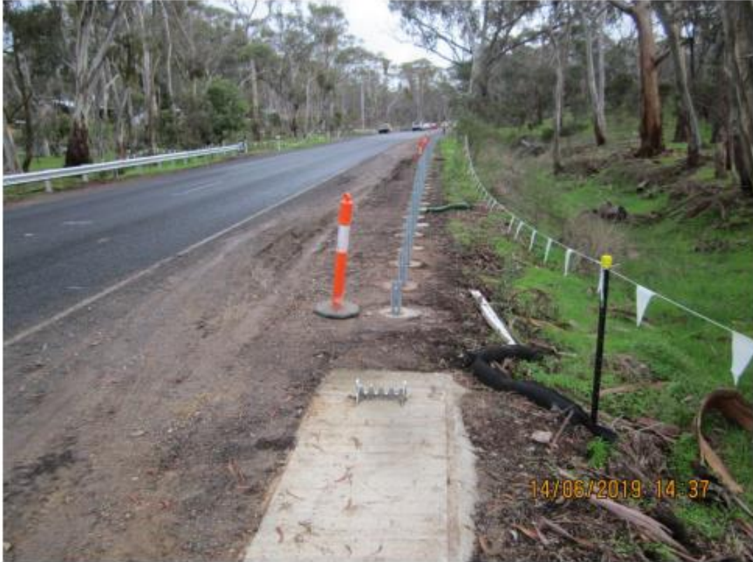
Plate 15. Pyrenees Hwy (Sec 2) Ch 13.120 – 12.995 km RHS, Limits of Works, 14 th June 2019.