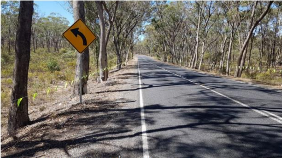
Plate 3. Pyrenees Hwy (Sec 2) Ch 13.700 – 13.9255km LHS, Limits of Works, 7 th March 2019.