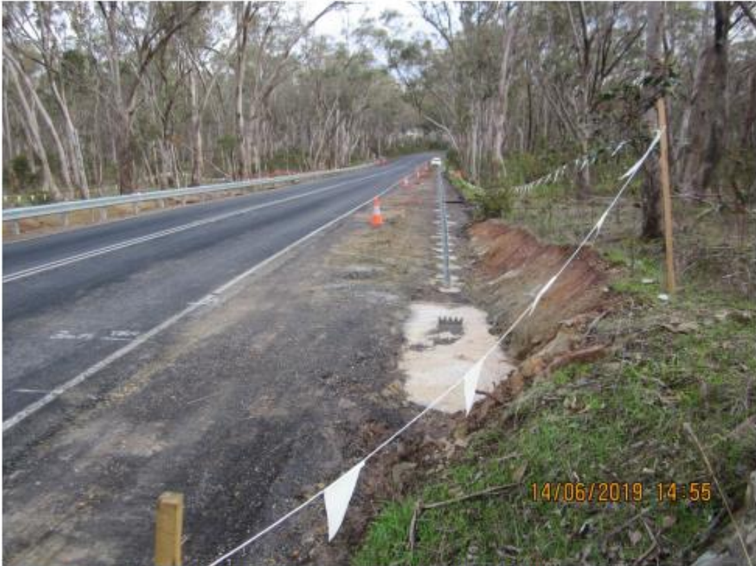
Plate 17. Pyrenees Hwy (Sec 2) Ch 12.560 – 12.445 km RHS, Limits of Works, 14 th June 2019.