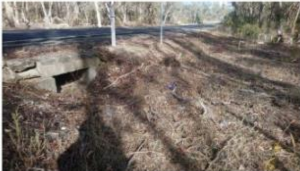
Photo 3: Pyrenees Highway, showing ground cover for fauna habitat (CH 13.610 - CH 13.690 LHS formation widening (fill construction))