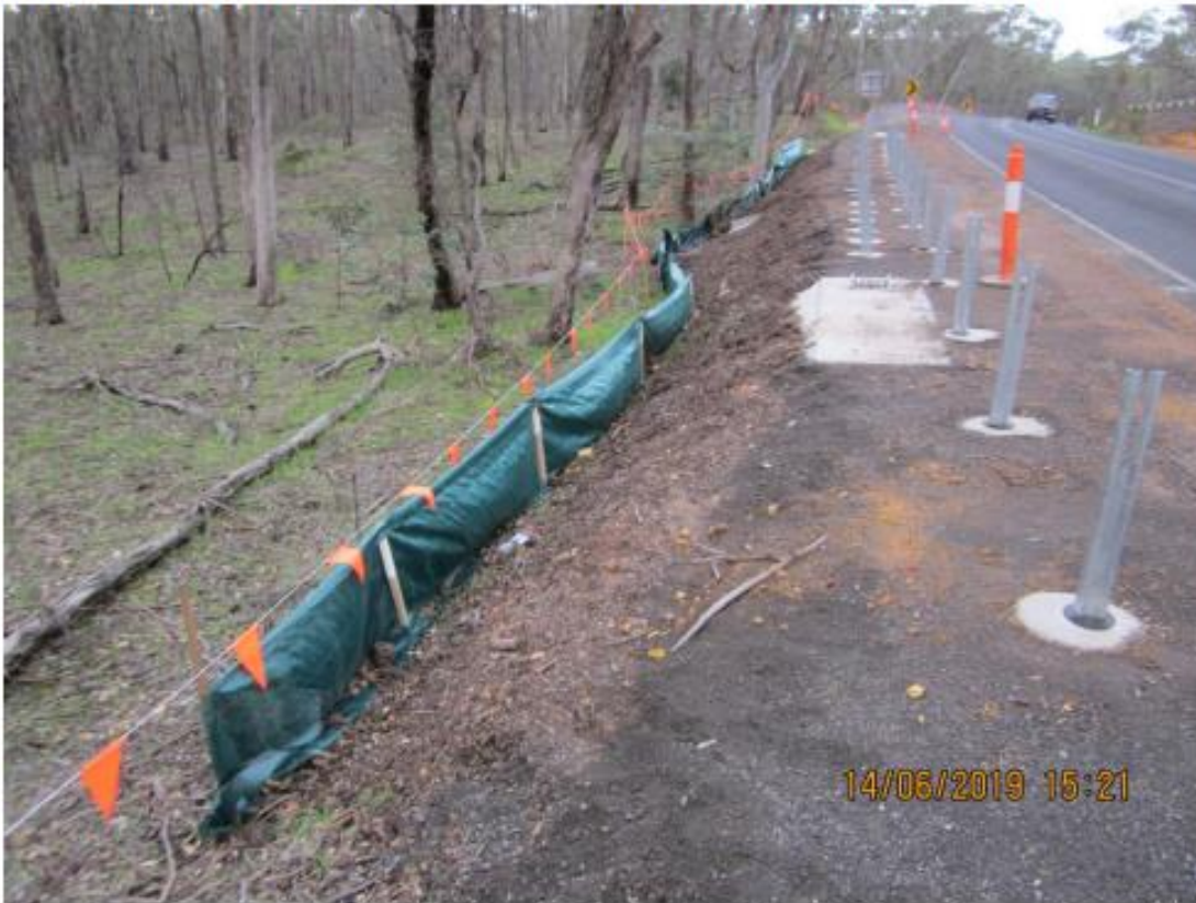
Plate 18. Pyrenees Hwy (Sec 2) Ch 11.880 – 11.405 km RHS, Limits of Works, 14 th June 2019.