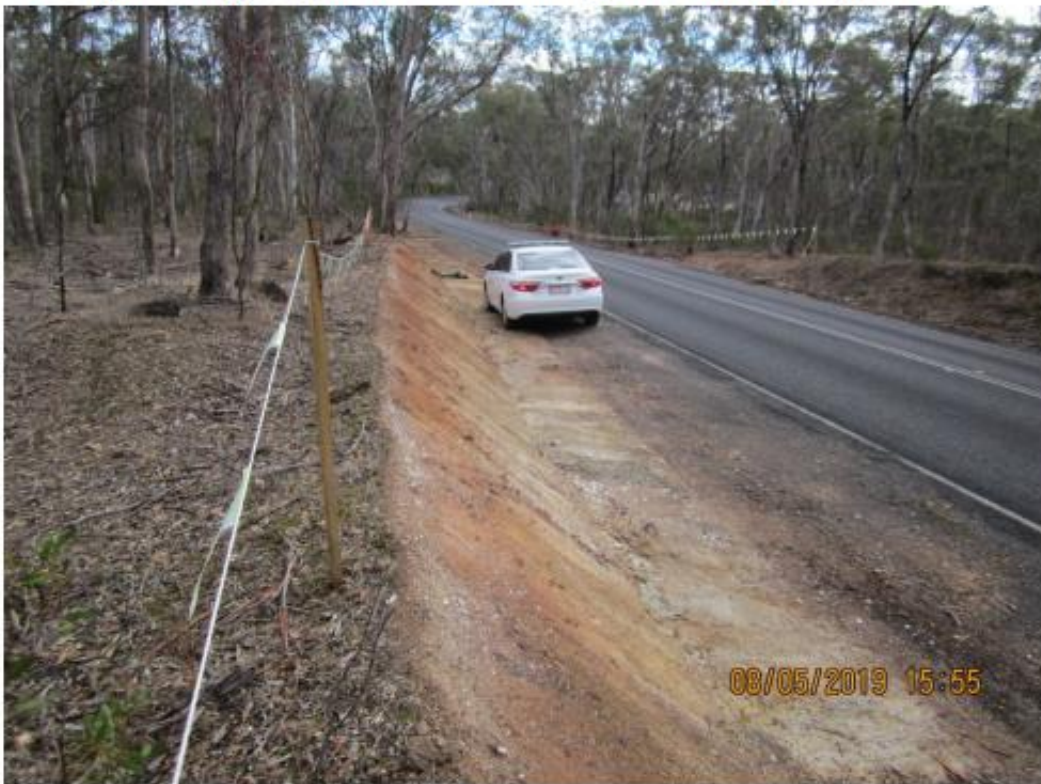
Plate 10. Pyrenees Hwy (Sec 2) Ch 12.405 – 12.570 km LHS, Limits of Works, 8 th May 2019.