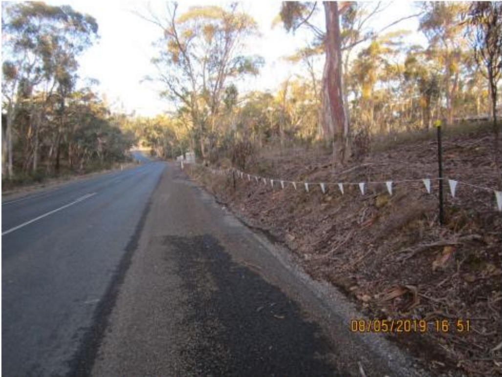
Plate 11. Pyrenees Hwy (Sec 2) Ch 13.100 – 13.325 km LHS, Limits of Works, 8 th May 2019.