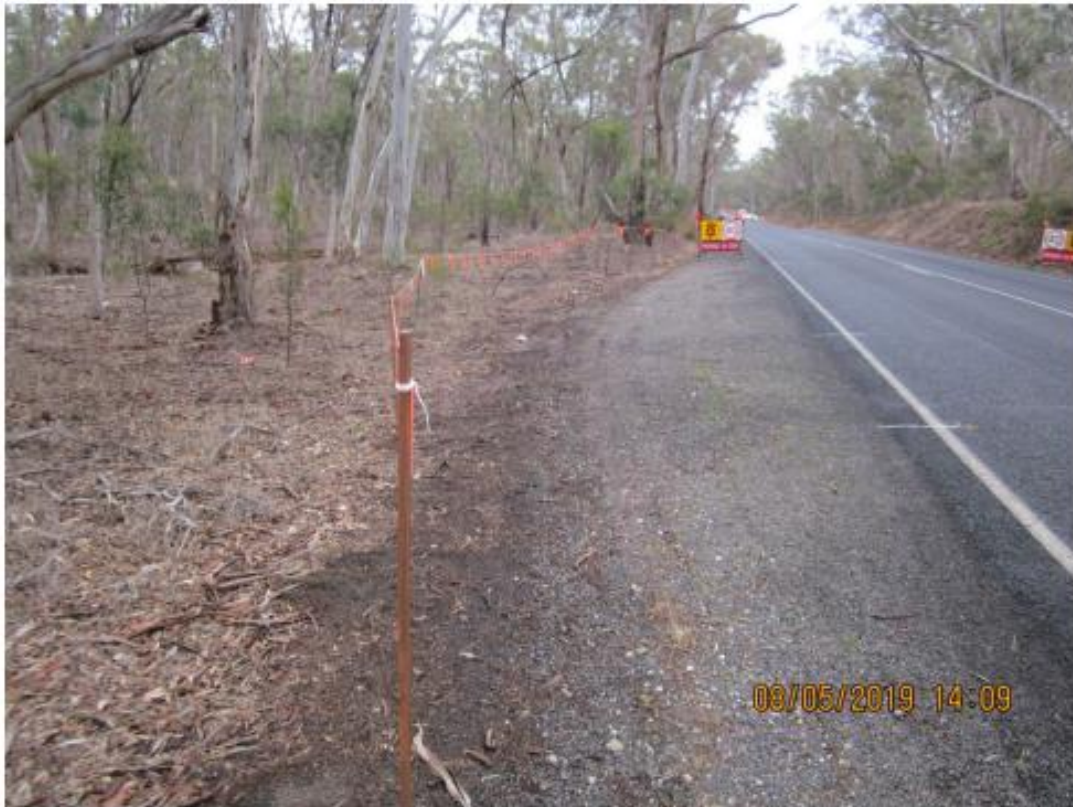
Plate 7. Pyrenees Hwy (Sec 2) Ch 10.195 – 11.047 km LHS, Limits of Works, 8 th May 2019.