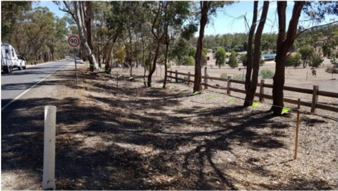
Plate 5. Pyrenees Hwy (Sec 2) Ch 14.000 – 14.070km RHS, Limits of Works, 7 th March 2019.