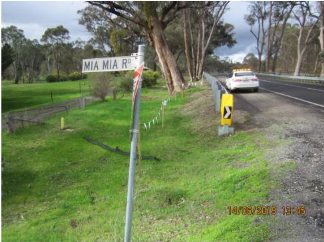
Plate 13. Pyrenees Hwy (Sec 2) Ch 14.800 – 14.705 km RHS, Limits of Works, 14 th June 2019.