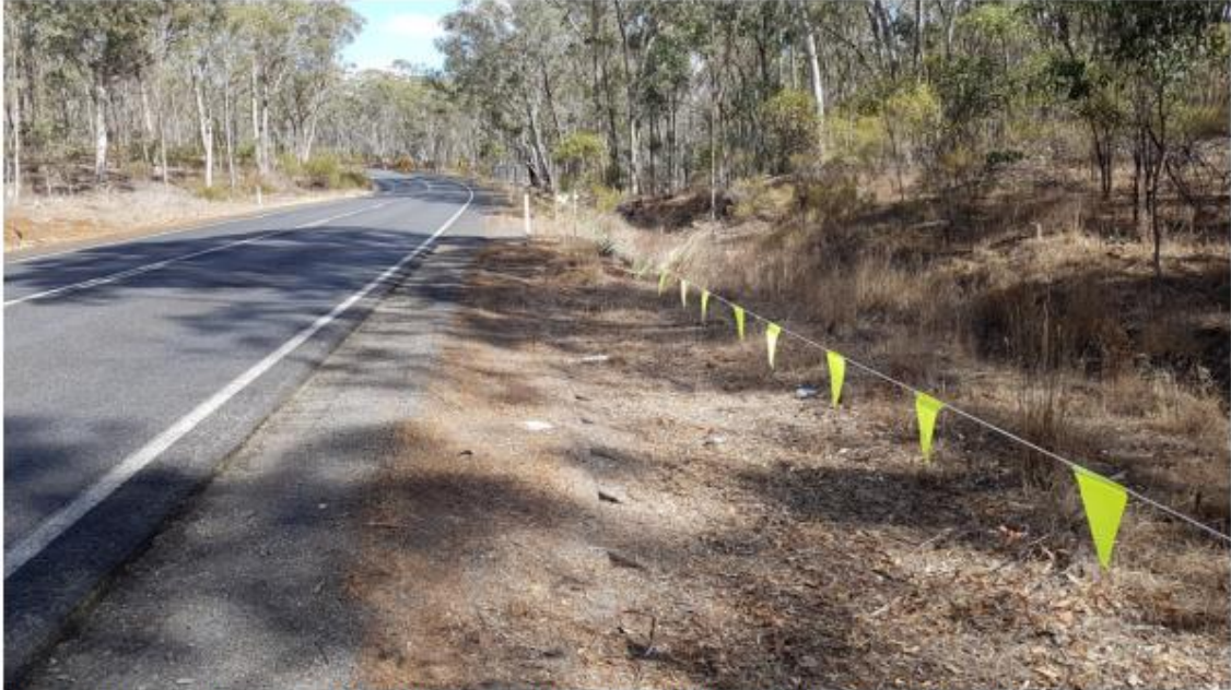
Plate 1. Pyrenees Hwy (Sec 2) Ch 11.125 – 11.390 km RHS, Limits of Works, 7th March 2019.