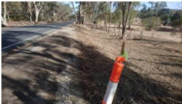
Photo 1: Pyrenees Highway, showing limited ground cover for fauna habitat

Much of the road verge within 3 meters of the road edge is degraded or has relatively low cover and provides no significant fauna habitat (Photo 1 is an example of low cover in the road verge).