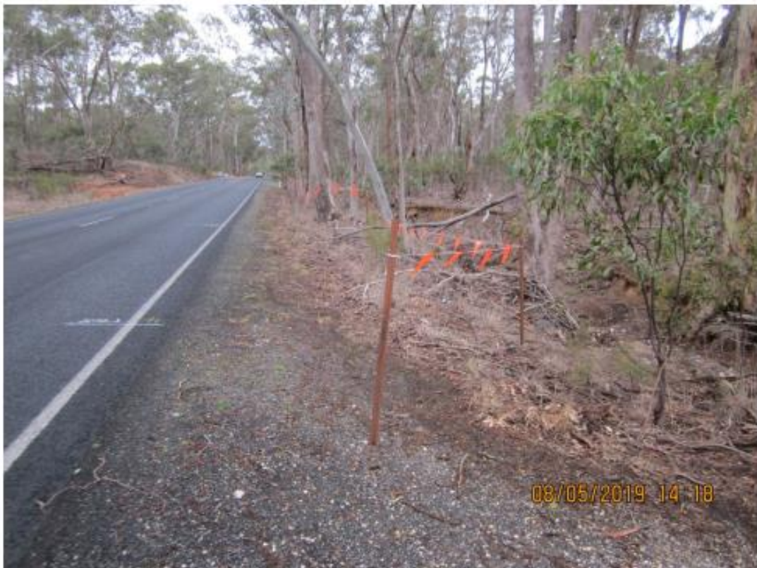
Plate 8. Pyrenees Hwy (Sec 2) Ch 10.195 – 11.047 km LHS, Limits of Works, 8 th May 2019.