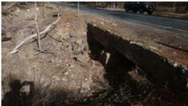
Photo 4: Pyrenees Highway, showing culvert and rocks; potential for fauna habitat (CH 11.14)