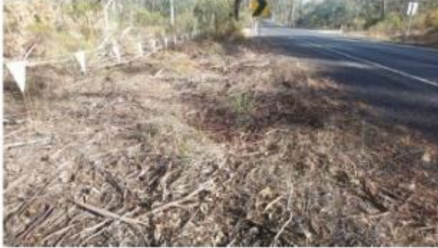
Photo 2: Pyrenees Highway, showing ground cover for fauna habitat (CH 11.115 - CH 11.150 LHS formation widening (fill construction))

PO Box 374, Woodend Victoria 3442, Australia Phone: + 61(0)3 5423 5282 Mobile: 0431 25 24 77 peter@wildlifecsi.com.au www.wildlifecsi.com.au ACN 121 459 390 ABN 29 121 459 390