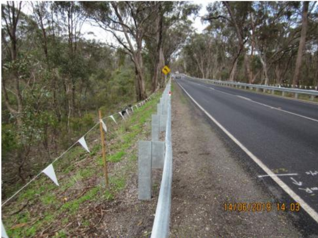
Plate 14. Pyrenees Hwy (Sec 2) Ch 13.925 – 13.700 km RHS, Limits of Works, 14 th June 2019.