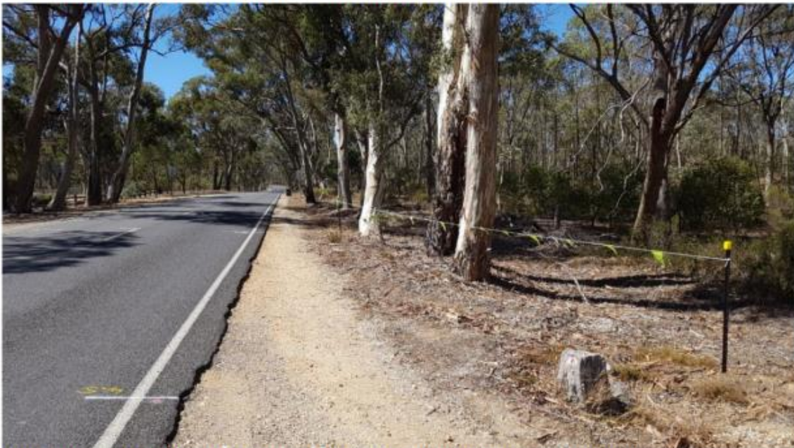
Plate 4. Pyrenees Hwy (Sec 2) Ch 13.705 – 14.065km LHS, Limits of Works, 7 th March 2019.