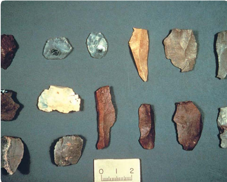
A group of artefacts of different size, shape and material